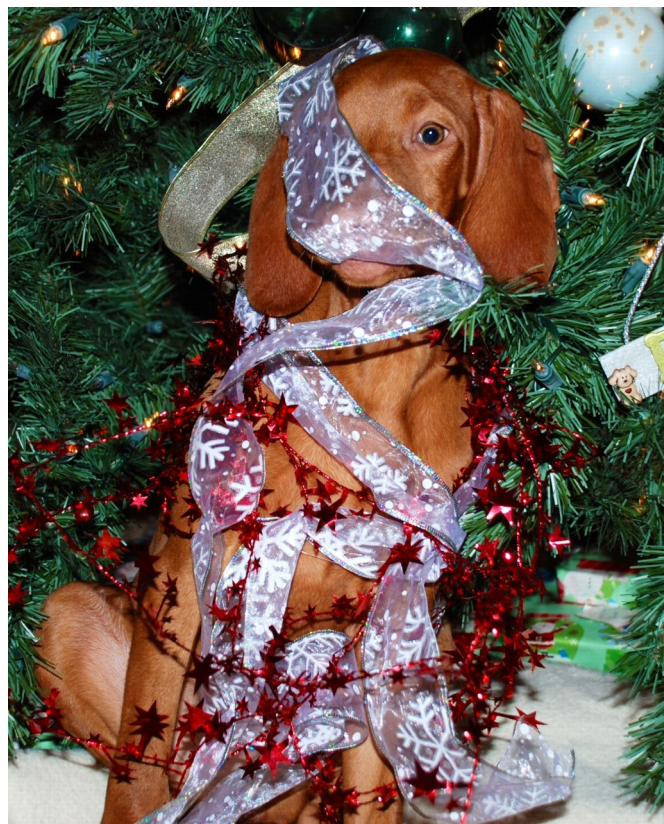
Zora (Just shy of 4 months) — Meilssa Lembke

Please check out the web version to see the other entries received.