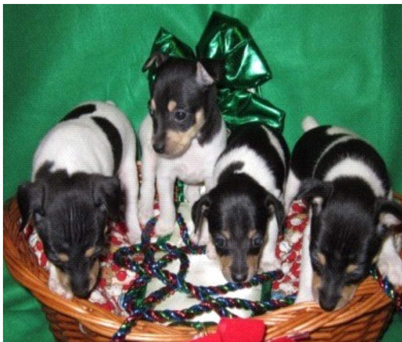
Icefox Puppies 2012 - by Donnanmarie Temple-Burgess