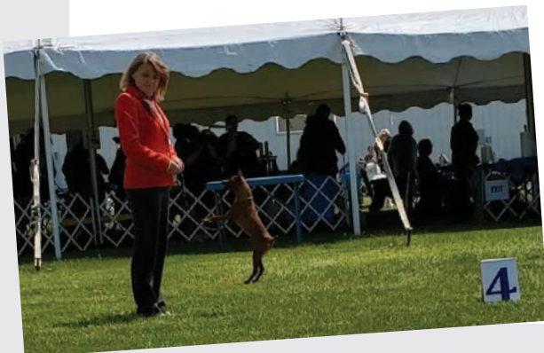
Connie and Lincoln took 4th in the toy group both Saturday and Sunday!